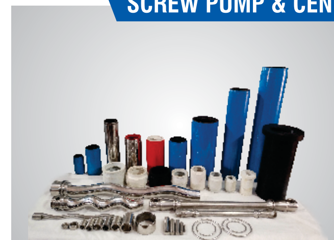
RETROFIT SCREW PUMP SPARES