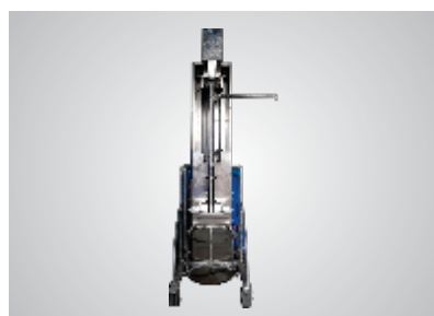
BARREL EMPTYING PUMP