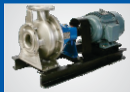
BACK PULL OUT TYPE CENTRIFUGAL PUMP