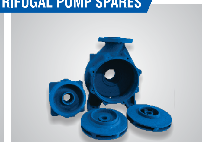
CENTRIFUGAL PUMP SPARES