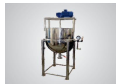
MANGO PULP BOILING KETTLE