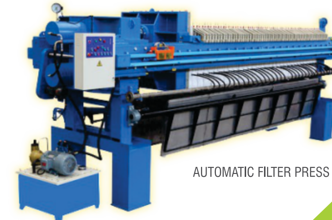
AUTOMATIC FILTER PRESS