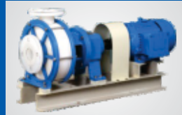
POLY PROLINE PUMP