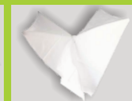
BUTTERFLY FILTER CLOTH